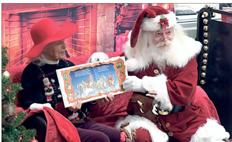
ABOVE: Santa and Mrs. Claus read "A Night Before Christmas" to a crowd of children at the library on Tuesday evening.