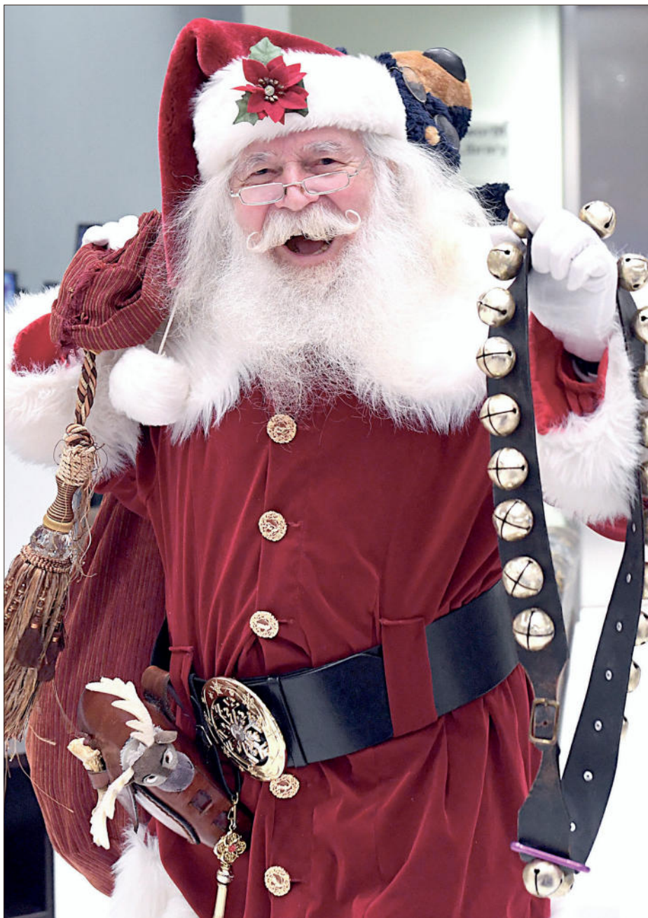
ABOVE: Santa arrives at the Butt-Holdsworth Memorial Library for Tuesday's activities.